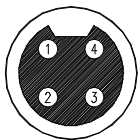
FACE VIEW SOCKET CONNECTOR