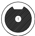
FACE VIEW SOCKET CONNECTOR