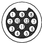
FACE VIEW SOCKET CONNECTOR