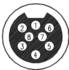
FACE VIEW SOCKET CONNECTOR