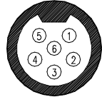
FACE VIEW PIN CONNECTOR